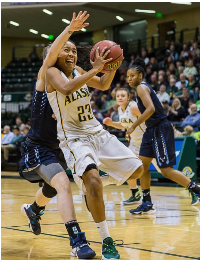
Kiki gets "hammered" by a Western Washington defender while driving the lane for a lay-up. UAA beat Western 79-52 winning the GNAC title with a record of 18-1 and an overall record of 31-1 at the time. The Seawolves were then ranked #1 or #2 in NCAA Div. 2.