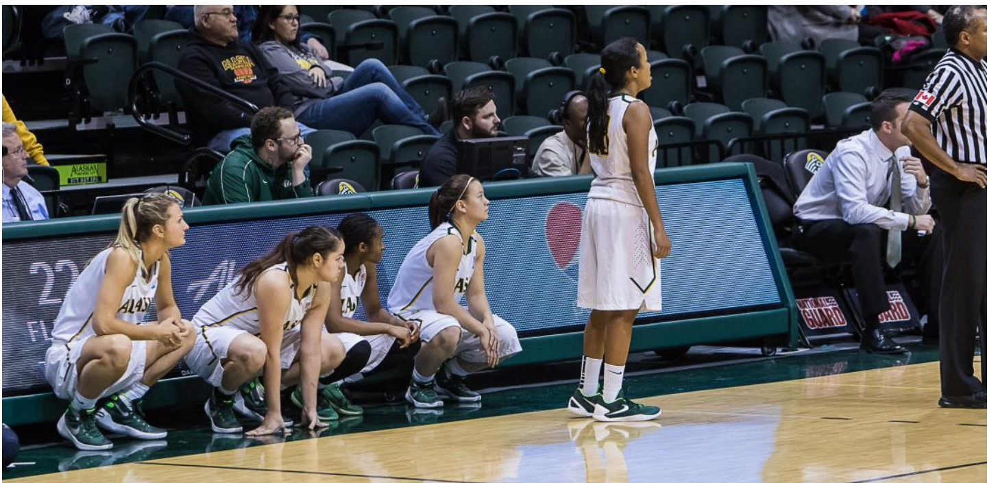
UAA often substitutes four or five players at one time to keep up the mayhem and high tempo game.