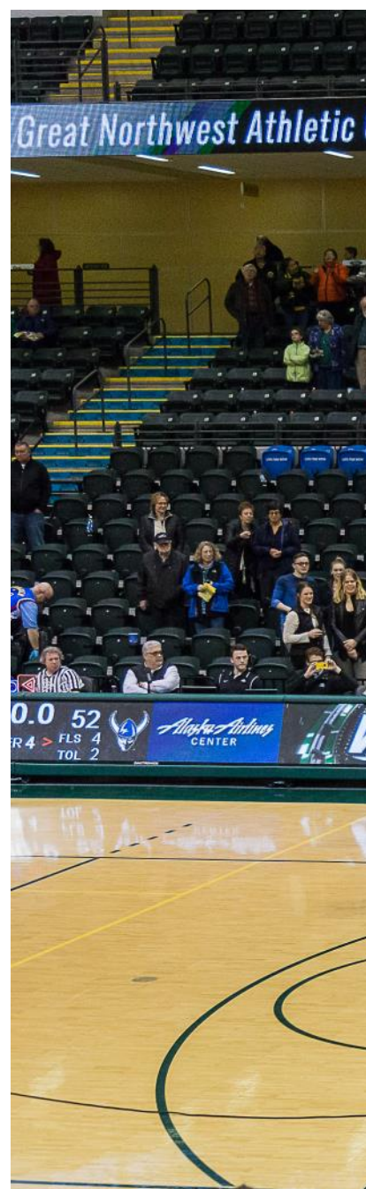
Players and fans celebrate following UAA's win over Western Washington to claim the championship of the GNAC at the Alaska Airlines Center in Anchorage on February 25, 2016.