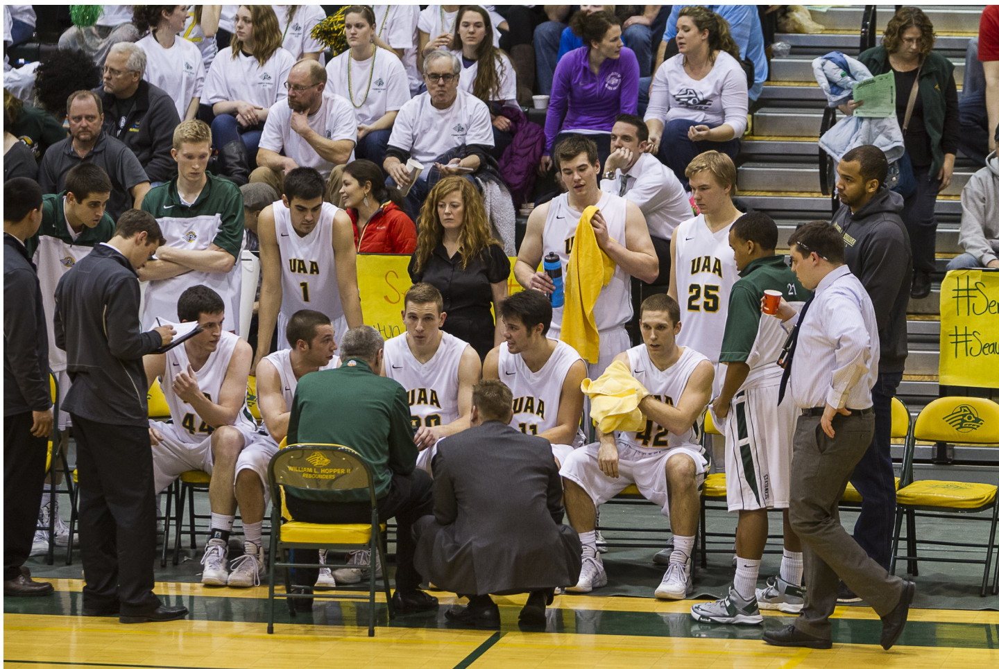
Players and coaches discuss the game during a timeout.