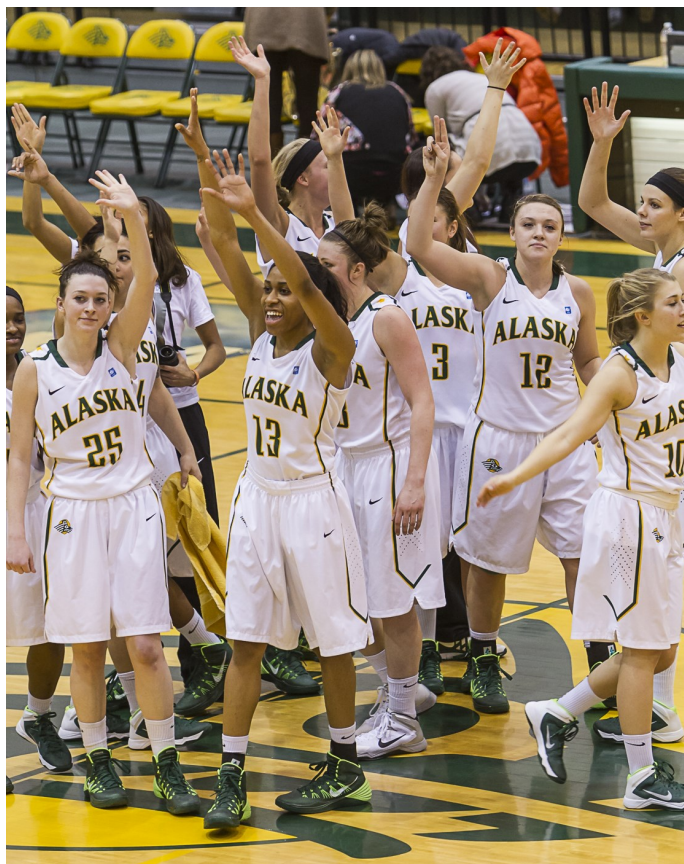
Celebration after winning 79-75 over Western Washington.